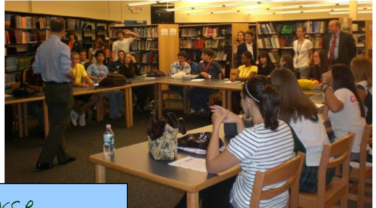
Student leaders share ideas with gubernatorial hopeful Jack Markell.

In his plan, Markell discussed four major areas that he would like to implement if elected Governor: establishing a Student Bill of Rights, establishing